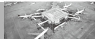
P.38-41 International Relationships Melbourne Airport, Australia