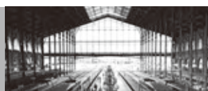
P.12-15 Book-Entry Transfer System for Stocks, etc. Paris Nord, France