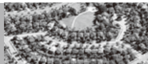
P.34-37 Custody Services for Foreign Stock Certificates, etc. Suburban housing, U.S.A.