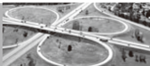
P.26-29 DVP Settlement System for NETDs Cloverleaf Interchange, U.S.A.