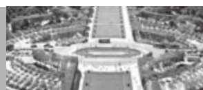
P.16-21 Book-Entry Transfer System for Commercial Paper and Corporate Bonds Parc du Champ-de-Mars, France