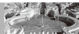
P.22-25 Book-Entry Transfer System for Investment Trusts St. Peter's Square, Italy