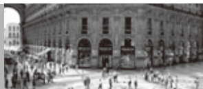
P.30-33 Pre-Settlement Matching System (PSMS) Galleria Vittorio Emanuele II, Italy